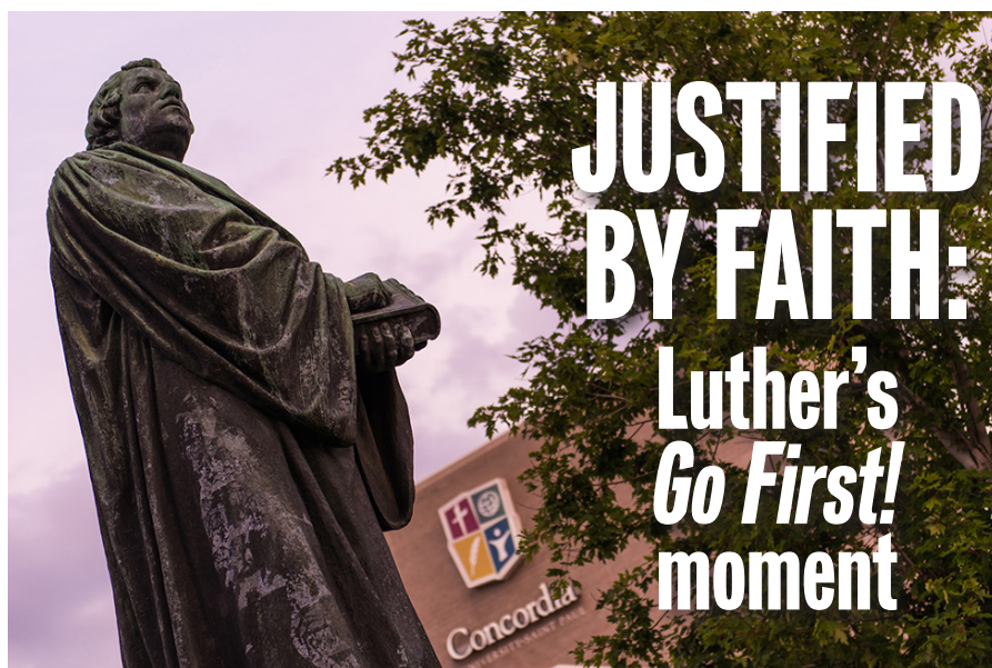
A statue of Martin Luther is pictured on the campus of Concordia University, St. Paul.

him. In 1530, they publicly confessed that people “are justified for Christ’s sake, through faith, when they believe they are received into favor and their sins are forgiven for Christ’s sake.” This confession was publicly stated to the Holy Roman Emperor in direct opposition to the teaching at the time and is known as Article IV of the Augsburg Confession.