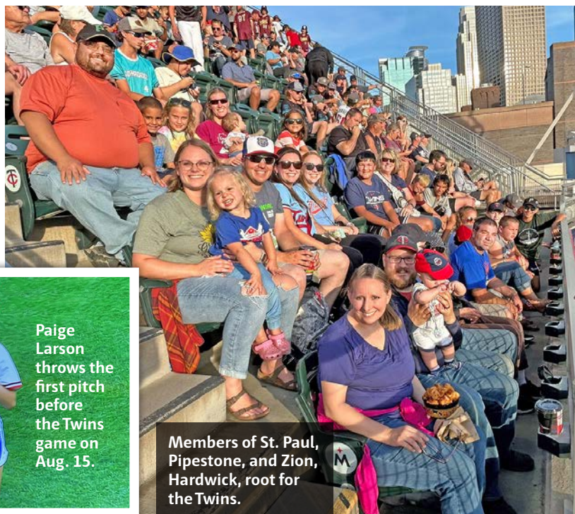
Members of St. Paul, Pipestone, and Zion, Hardwick, root for the Twins.