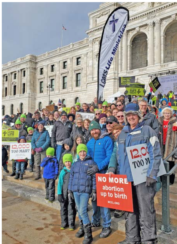
LCMS members from around the district gathered at the steps of the capitol in St. Paul for the 2024 March for Life, held annually on the anniversary of the legalization of abortion

The trip to the March for Life was sponsored by the school's Knights4Life, which sponsors activities throughout the year to promote the value of all life from conception to natural death. This is the second time students from the school have attended the March for Life, something they hope to do on a regular basis in the future.