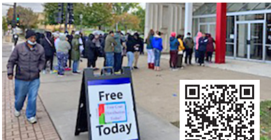
People line up for the winter-clothing giveaway. (Scan the QR code to give to the outreach center.)

Our official kick-off event was an international potluck on Sept. 8 at Jehovah. Six of the St. Paul Circuit congregations and the Concordia University, St. Paul campus ministry partnered in holding this celebration. About 100 people attended, including congregational